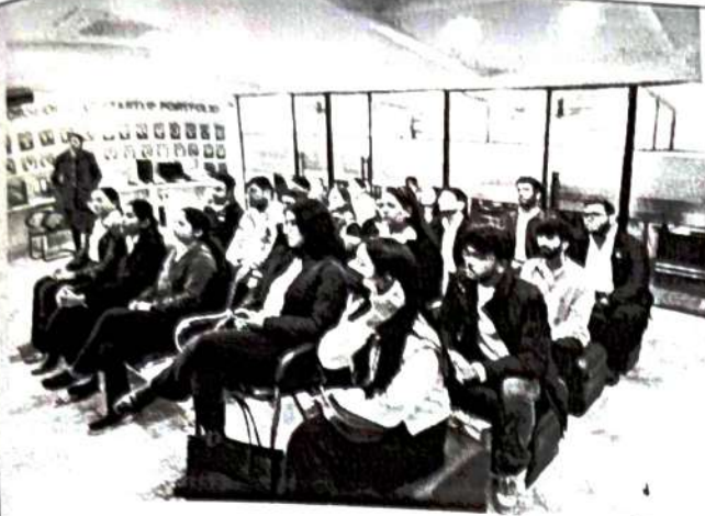
“Future Founders in the Making — Ship Your Career Forward with TradeFlock”