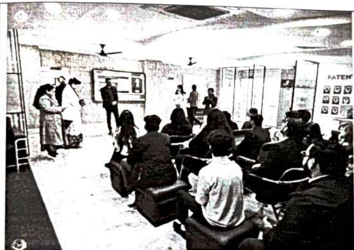
“Landing Your First Big Break — TradeFlock Campus Drive Is Where Careers Take Off”