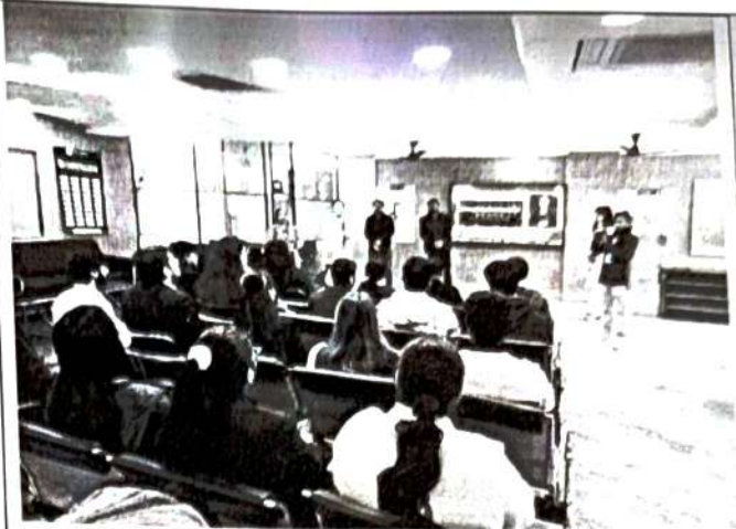
“Landing Your First Big Break — TradeFlock’s Campus Drive Is Where Careers Take Off”

Report: Description in (min 250 to max 800 words)*