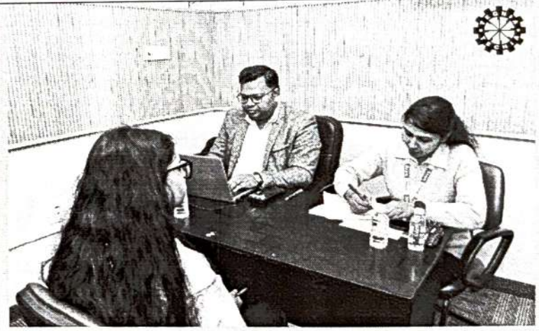
Interview Round: Recruiters from participating companies conducting a face-to-face interview with a student during the campus placement drive.