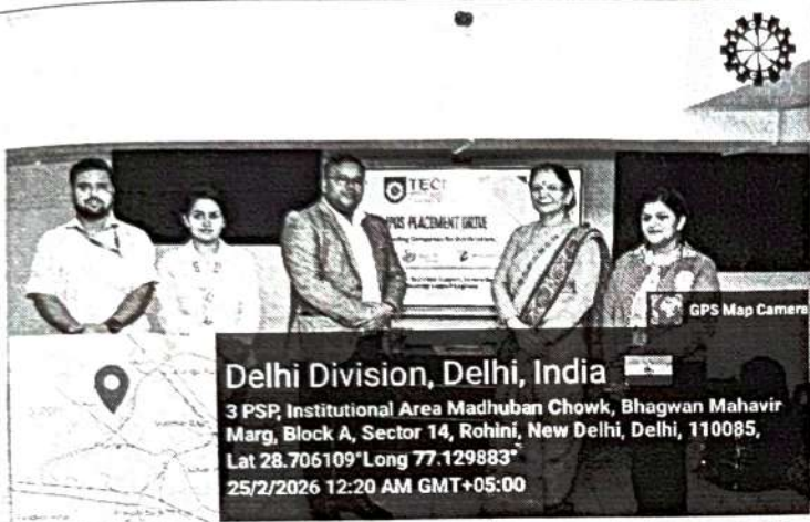
Organizing Team: Faculty members and placement coordinators of Tecnia Institute of Advanced Studies with company representatives during the campus placement event.