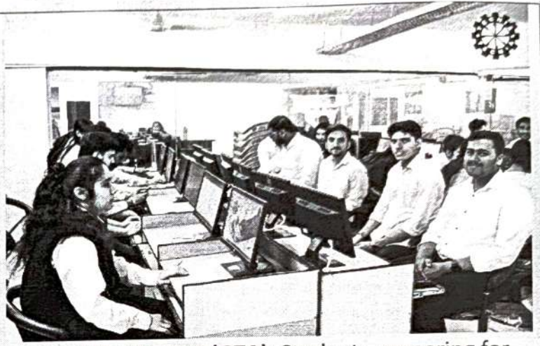
General Ability Test (GTA): Students appearing for the online assessment round in the computer lab as part of the recruitment process.