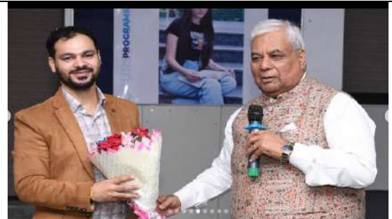
Moments of joy and gratitude from the institutional celebration at TIAS, bringing faculty and staff together in the true spirit of togetherness.

Report: Description in (min 250 to max 800 words)*