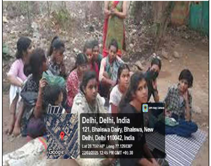
Villagers participated in Awareness on Sanitation