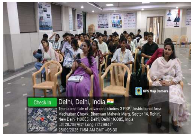
Exploring Indian Knowledge Systems as the ethical foundation of responsible journalism.