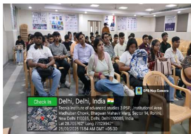
Understanding ethical journalism through the lens of Indian Knowledge Systems.