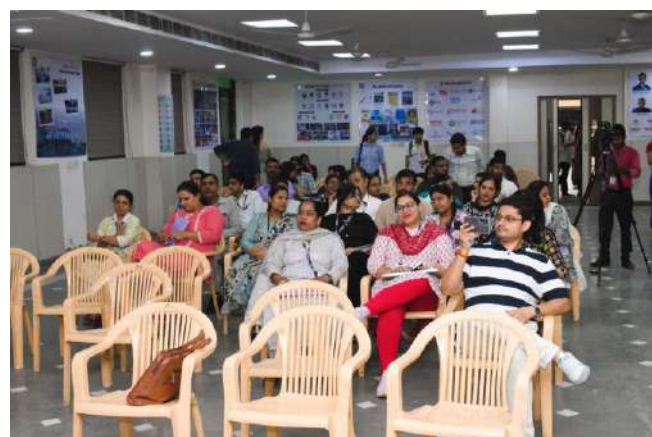
cultural values in journalism.