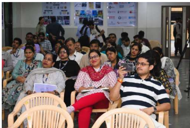
Reviving traditional values for ethical media practices.