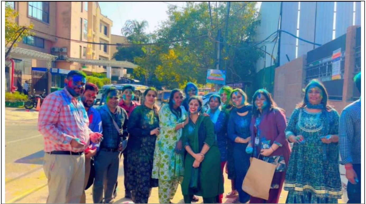
Celebrated the festival of Holi with enthusiasm and cultural spirit at TIAS Campus.