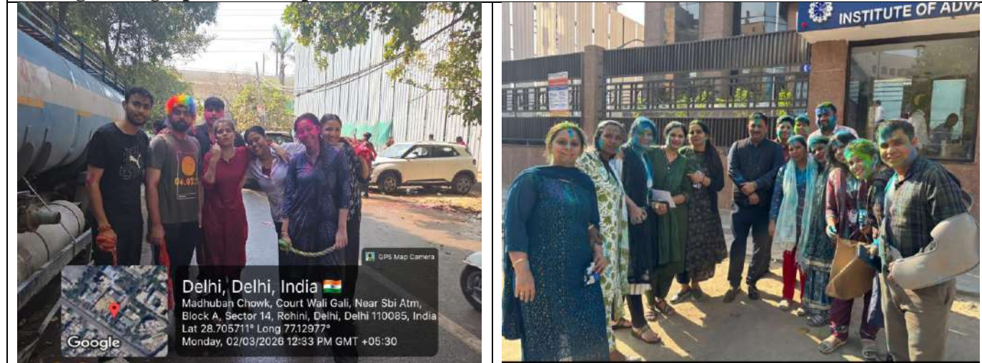
Students and Staff celebrating Holi with enthusiasm and festive spirit.

In-Charge Cultural Club In-Charge Technical Club Tecnia Institute of Advanced Studies Madhuban Chowk, Rohini, Delhi