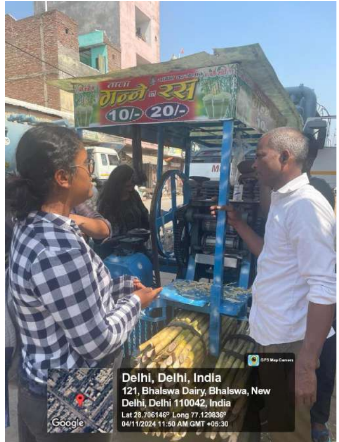
Student talk with local person