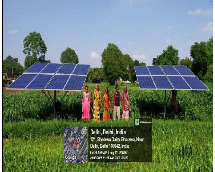
Empowered by the Sun: Villagers stand proudly beside solar panels, embracing clean energy for a greener and self-reliant future