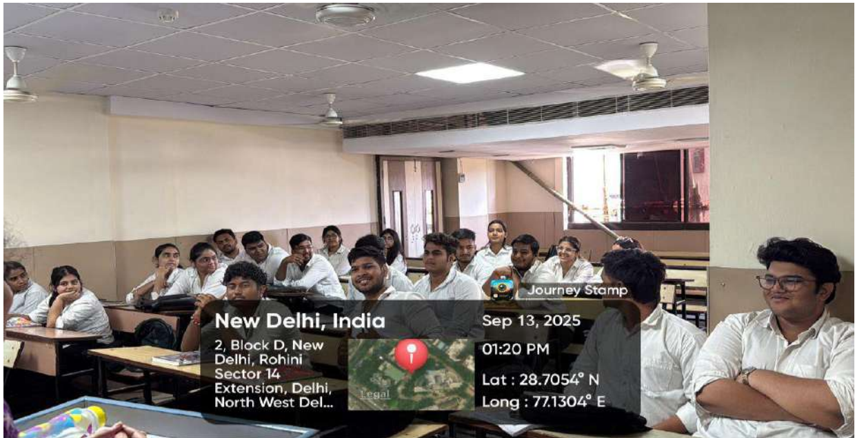
Students actively expressing thoughts and experiences during the awareness activity.