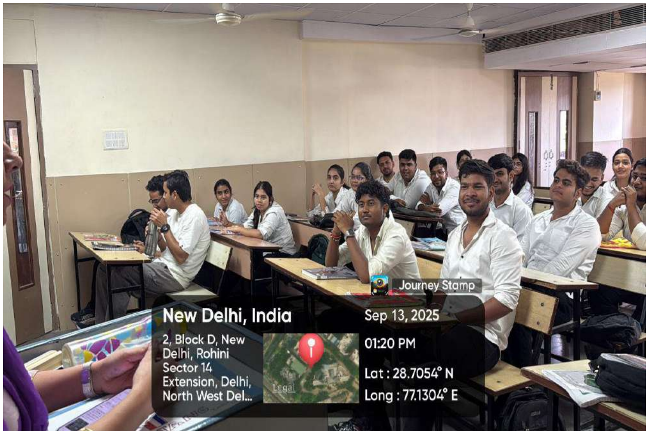
Students are highlighting gender-based experiences and social realities.