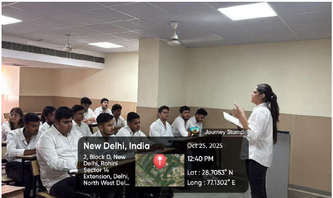
Students engaging in reflective discussion on the impact of gender-based and social labeling.

Report: Description in (min 250 to max 800 words)*