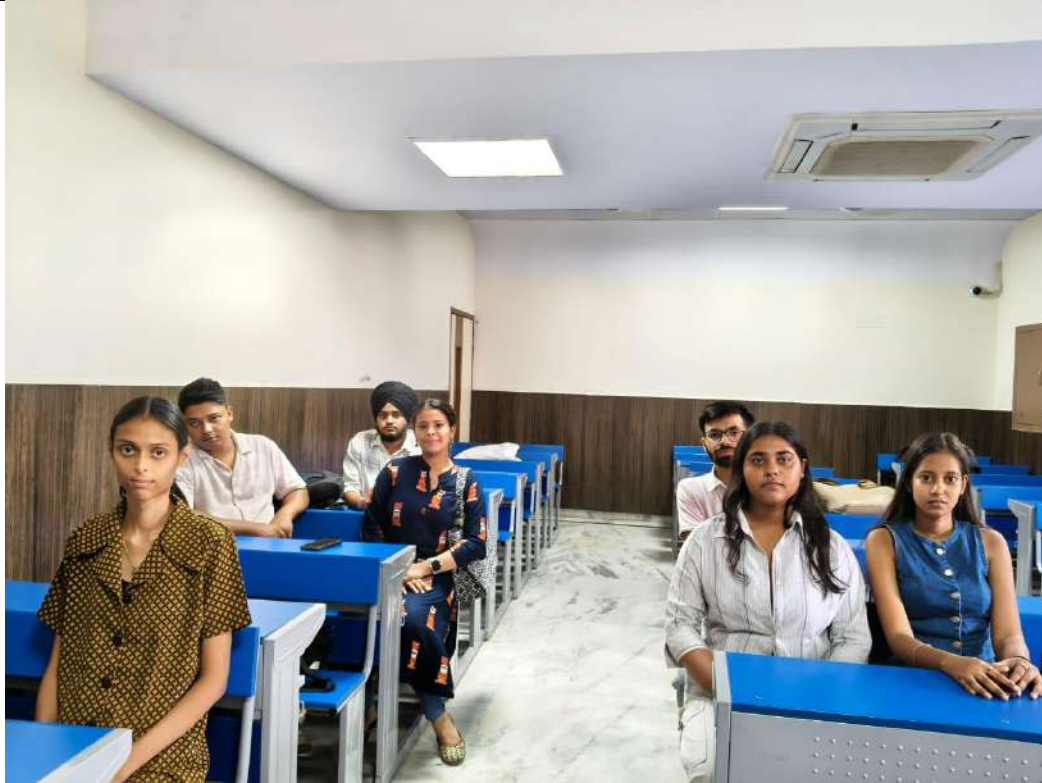
Students participating in a case study session in a classroom environment, engaged and ready to collaborate for academic learning and discussion.