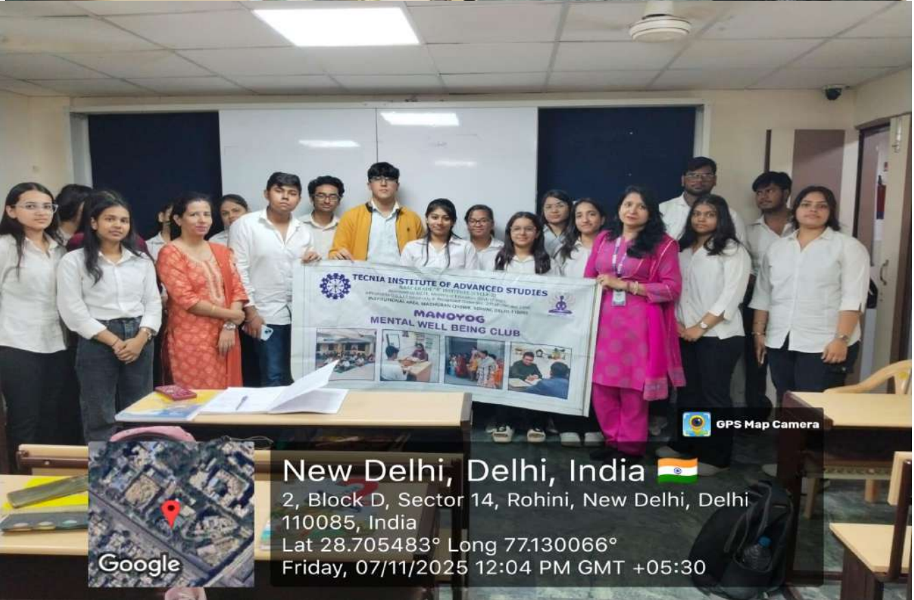
Students participating in the “Work-Life Balance & Digital Detox” session organized by Manoyog – Mental Well-Being Club, TIAS, to encourage mindful living and healthy screen habits.