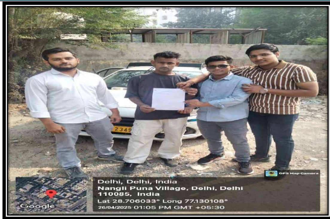
Students creating awareness about the procedure of Digital Electoral Photo Identity Card