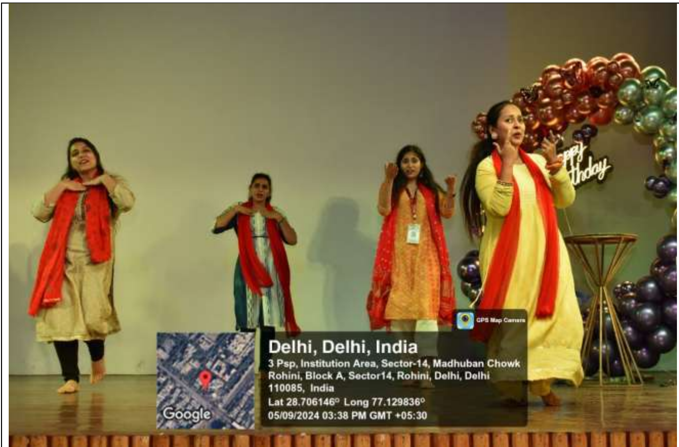
A vibrant cultural performance by faculty members