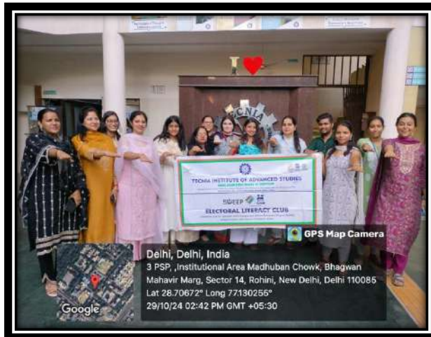
Faculty members and students pledging to actively participate in voting in the future.

Report: Description in (min 250 to max 800 words)*