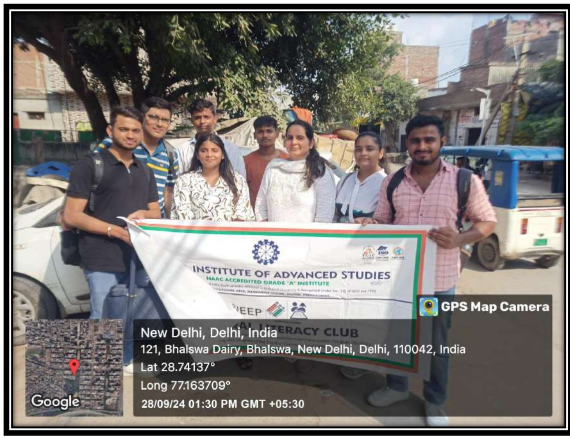
Students Spreading Awareness on the Registration Process for Online Voter App – Your Vote, Your Power