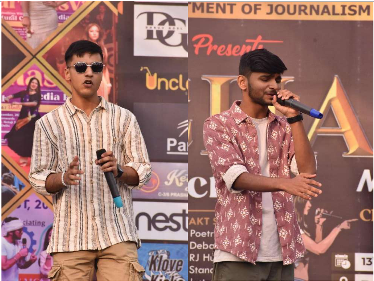
Enthusiastic students participating in Rap Battle

Report: Description in (min 250 to max 800 words)*