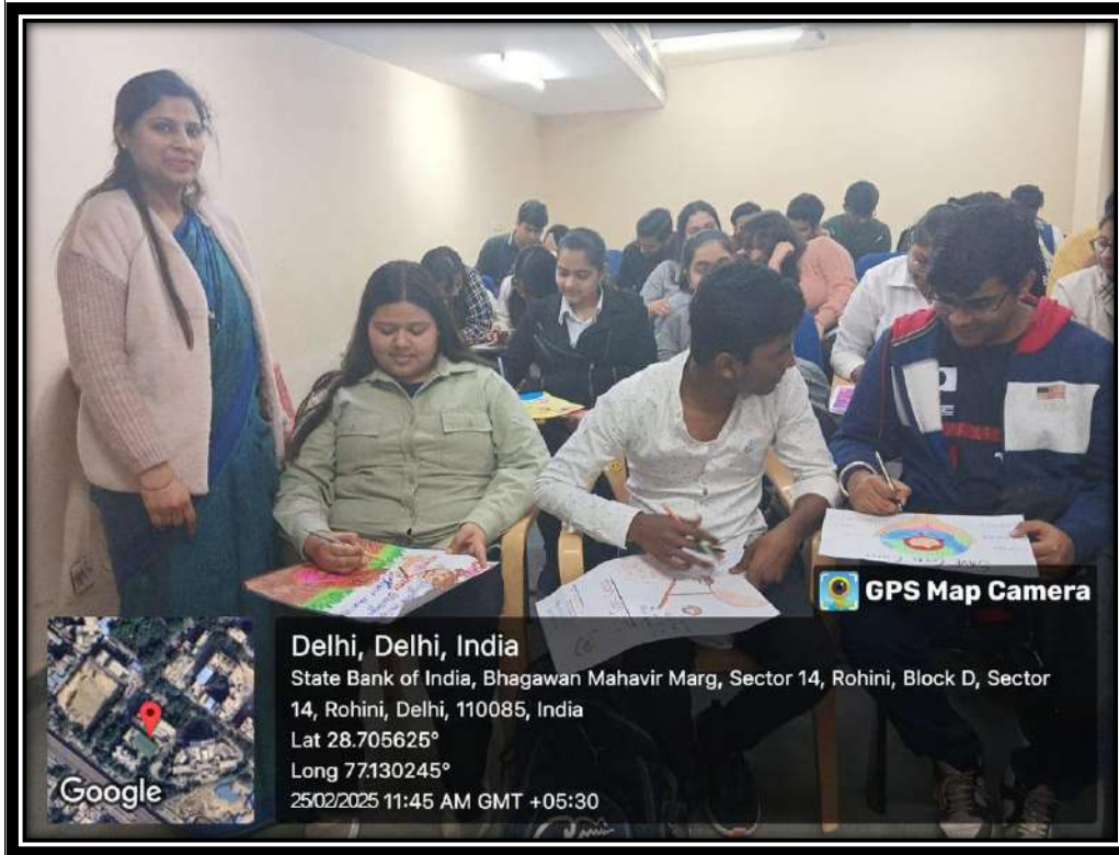
Students enthusiastically participating in Poster Making Competition