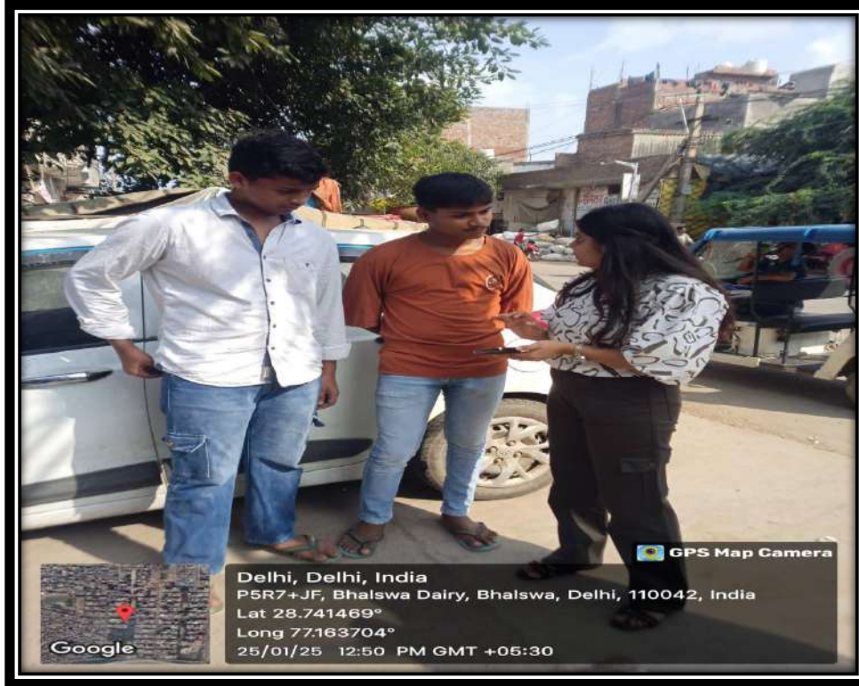
Student showing registration process to the residents

Report: Description in (min 250 to max 800 words)*