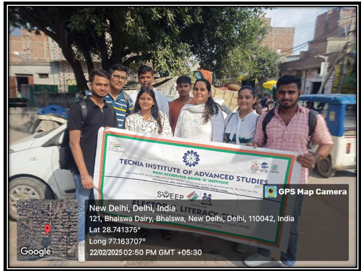
Students while organizing registration drive for Election I card

Report: Description in (min 250 to max 800 words)*