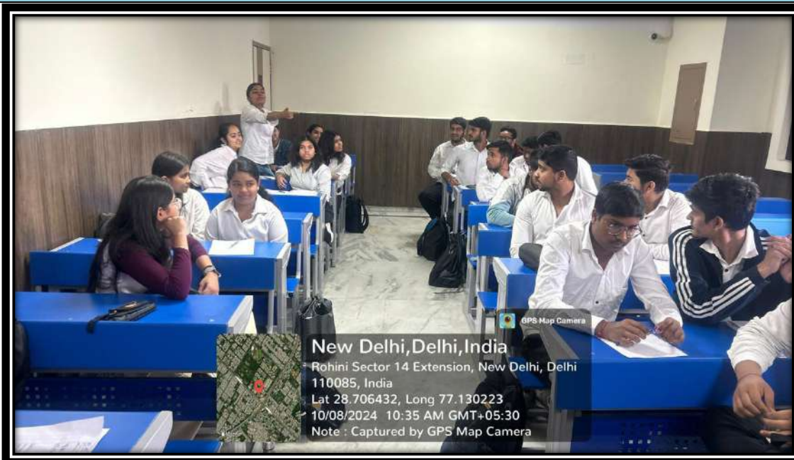
Students enthusiastically engaged in group discussion.