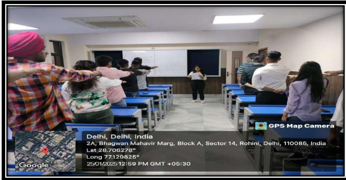
Students taking pledge to vote in future for sure.

Report: Description in (min 250 to max 800 words)*