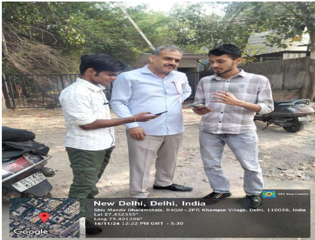
Students raising awareness about the Voter Service Portal.

Report: Description in (min 250 to max 800 words)*