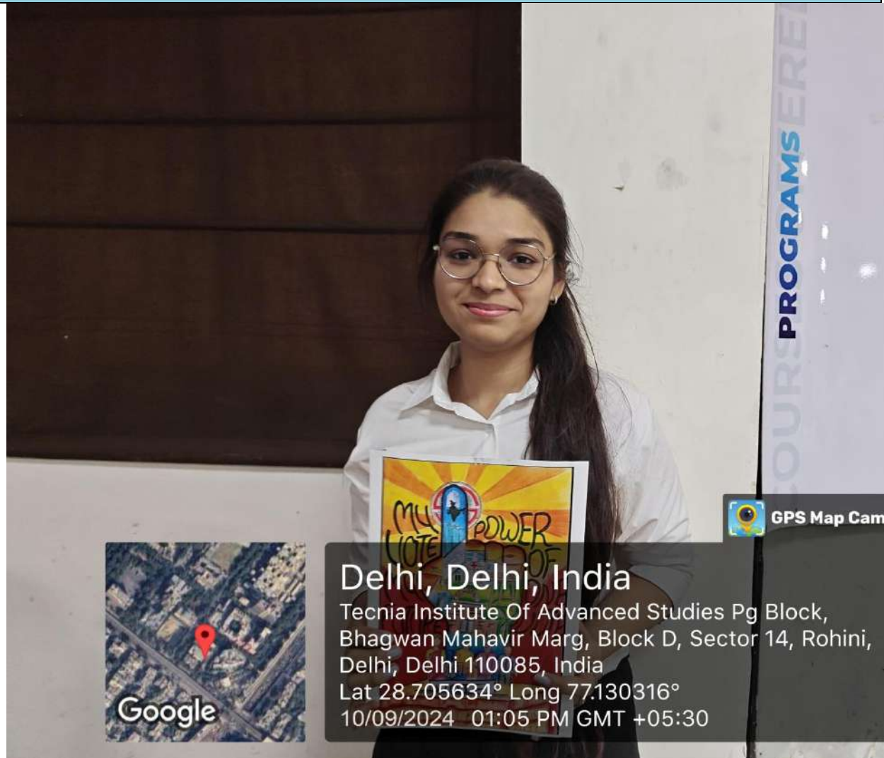
Student with poster for ELC Wall Magazine