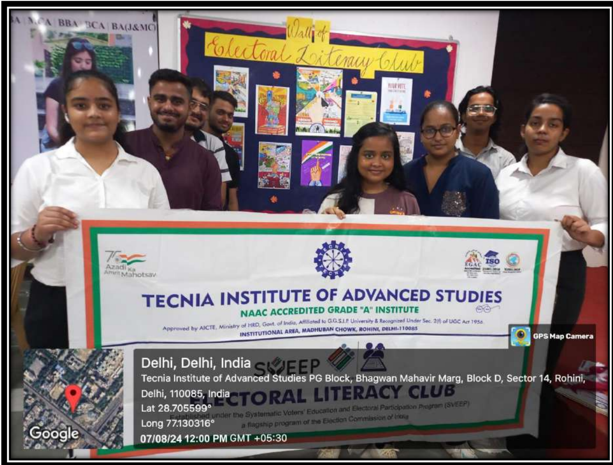
Energetic students gathered in front of the Electoral Literacy Club.

Report: Description in (min 250 to max 800 words)*