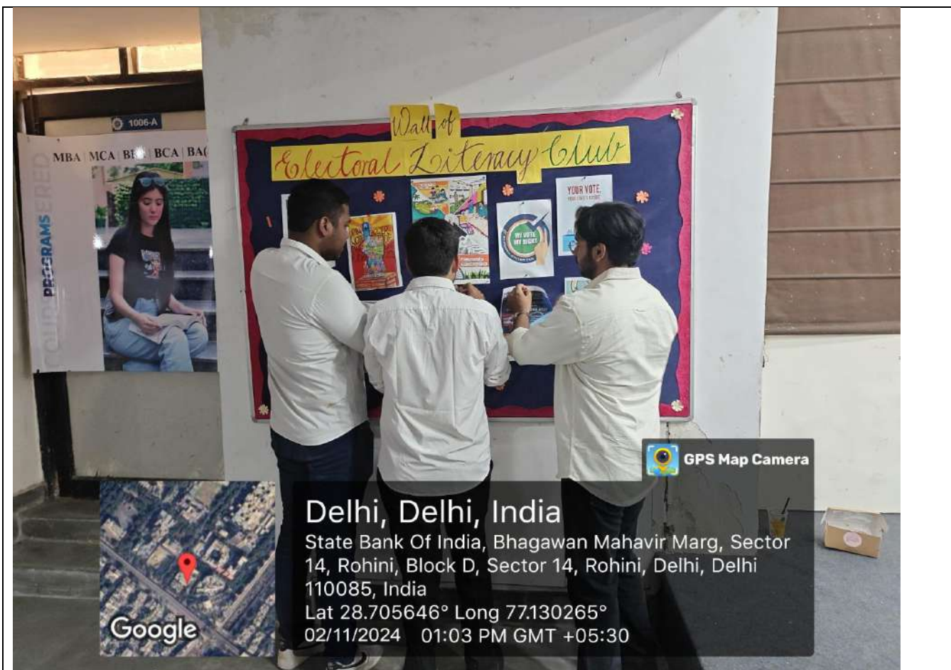
Students updating the wall as per the theme

Report: Description in (min 250 to max 800 words)*