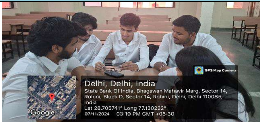
Students discussing about the EVM/VVPAT