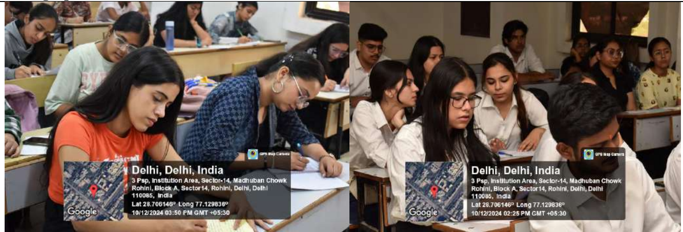
"Students passionately pen their thoughts during the Creative Writing Competition on World Human Rights Day, expressing their perspectives on justice, equality, and freedom."

Report: Description in (min 250 to max 800 words)*