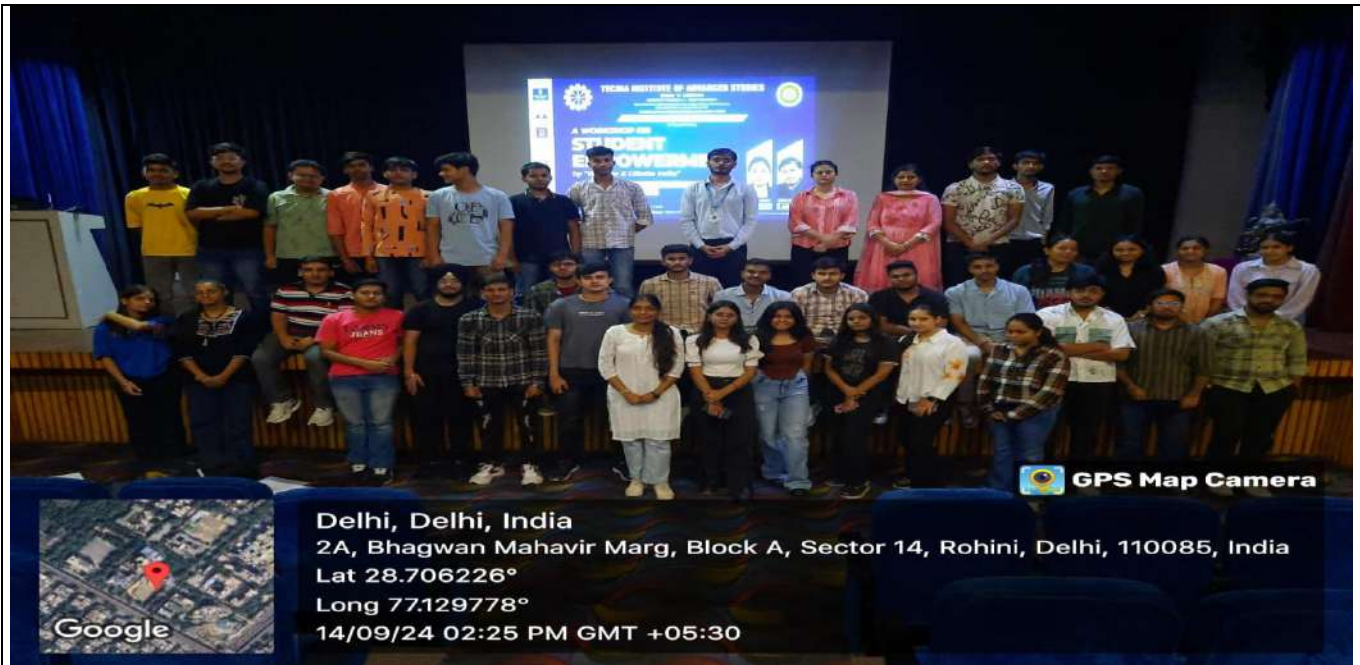
TIAS students demonstrate their body posture as a part of the session