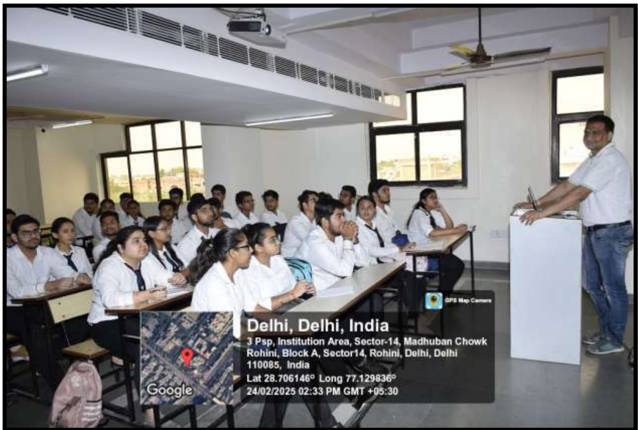
Students attending workshop on Gender-inclusive language