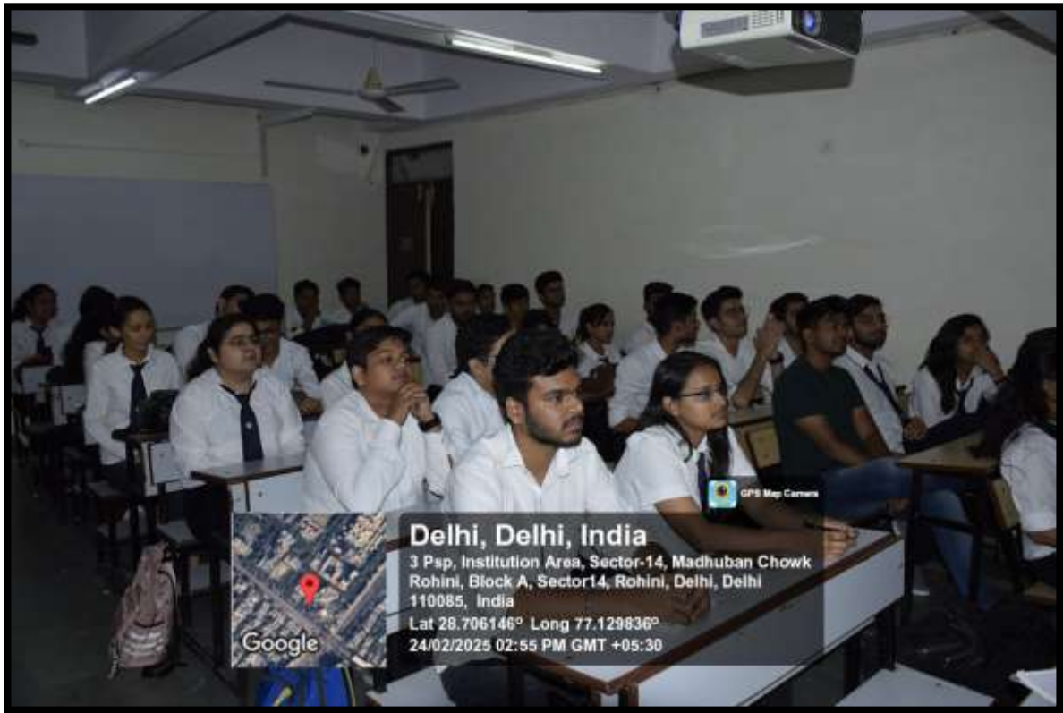
Students attending workshop on Gender-inclusive language