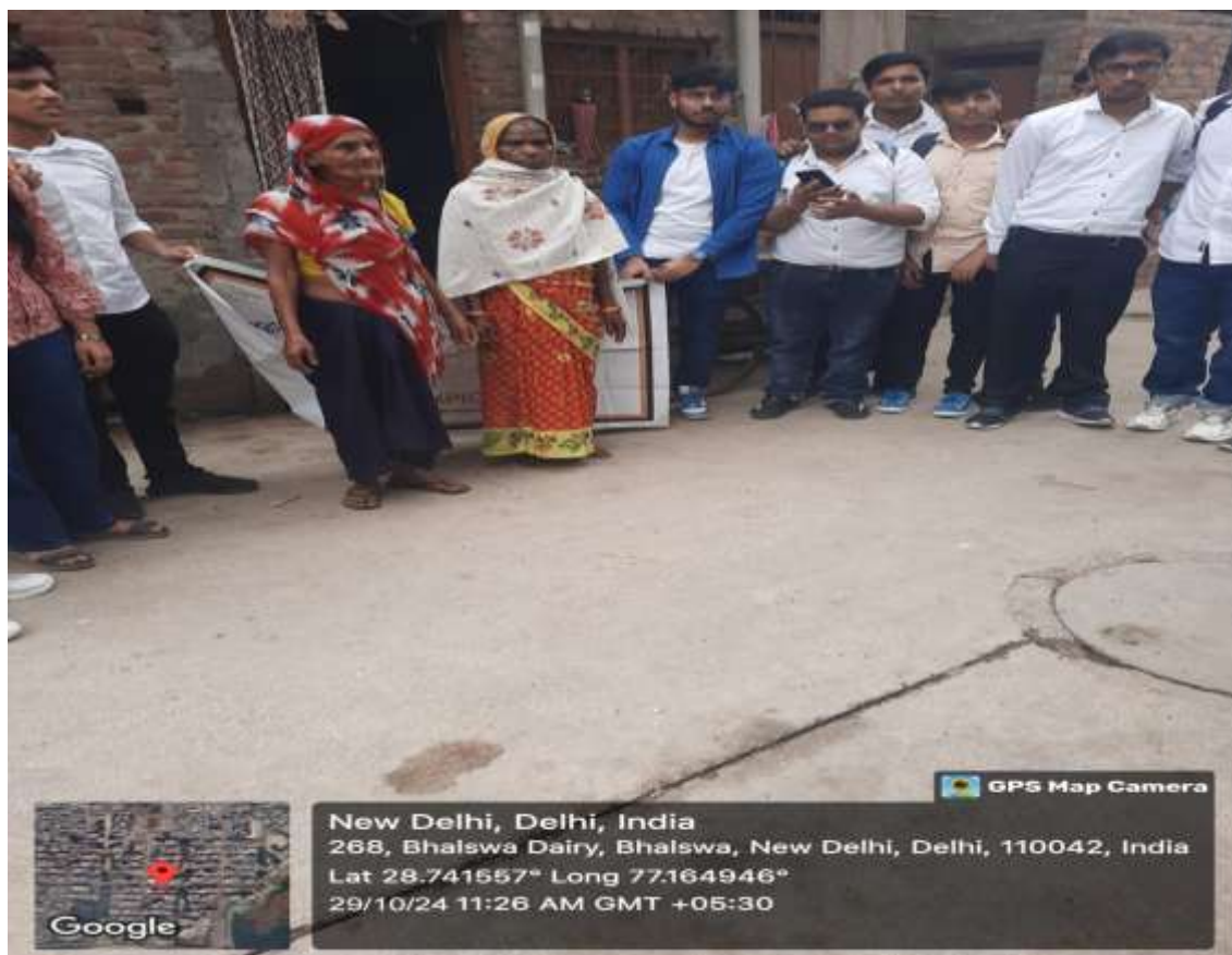
Students with community members creating awareness about Women's Rights and Empowerment