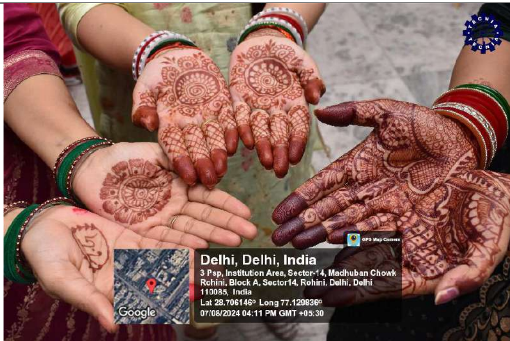
Students and faculty members feel the vibes o festivity of with application of Henna