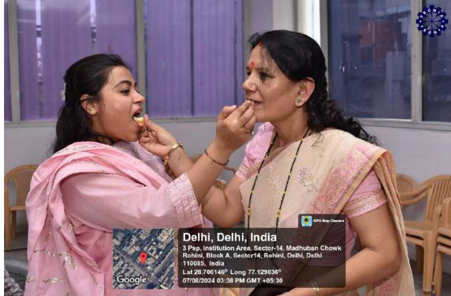
Enjoyment while sharing the sweets