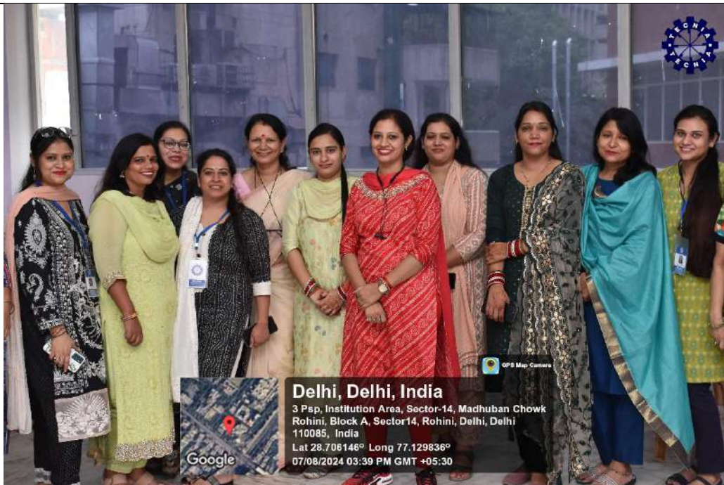
Faculty Members during Teej Celebration