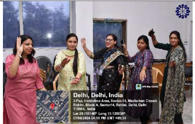
Gathering enjoying the Teej Festival on the beats of music