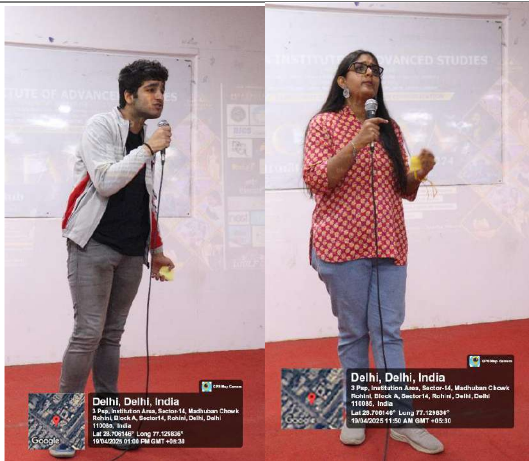
Voice of expression – Powerful storytelling performances that brought imagination, emotion, and awareness alive on stage."