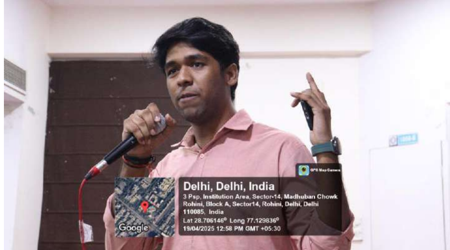
Weaving words into wisdom – A storyteller captures hearts and minds.