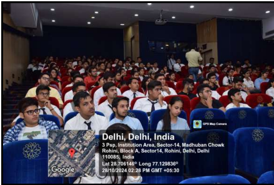
Students attending the Seminar on Role Play on issues faced by women in workplace