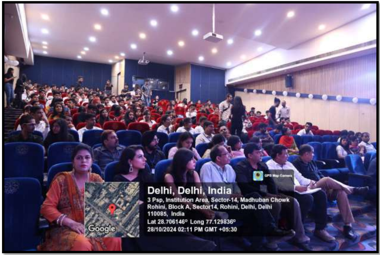
Students attending the Seminar on Role Play on issues faced by women in workplace