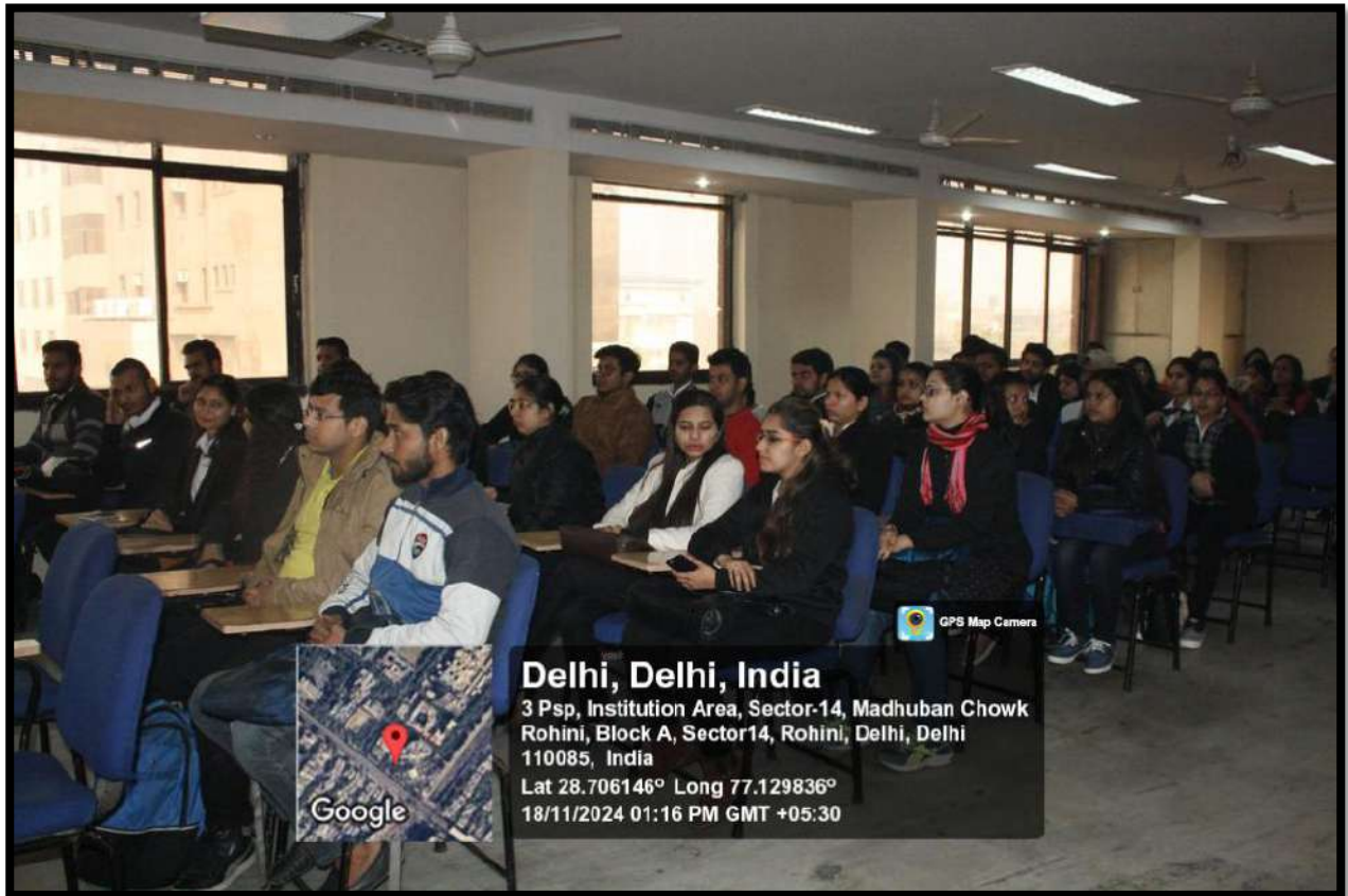
Students attending the session on Role Play on issues faced by women in workplace