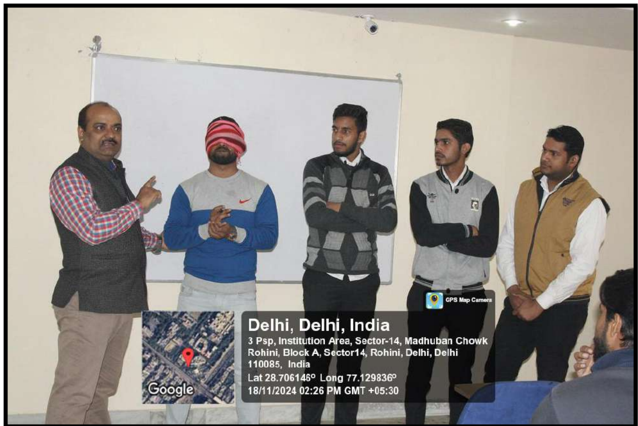
Students attending the session on Role Play on issues faced by women in workplace