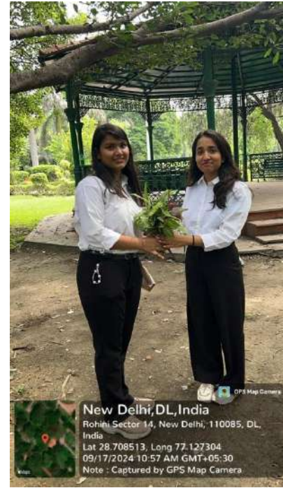
Students Participate in “Tree Plantation Drive”

Social media link (promoting in any one Facebook/Instagram/Twitter is mandatory)