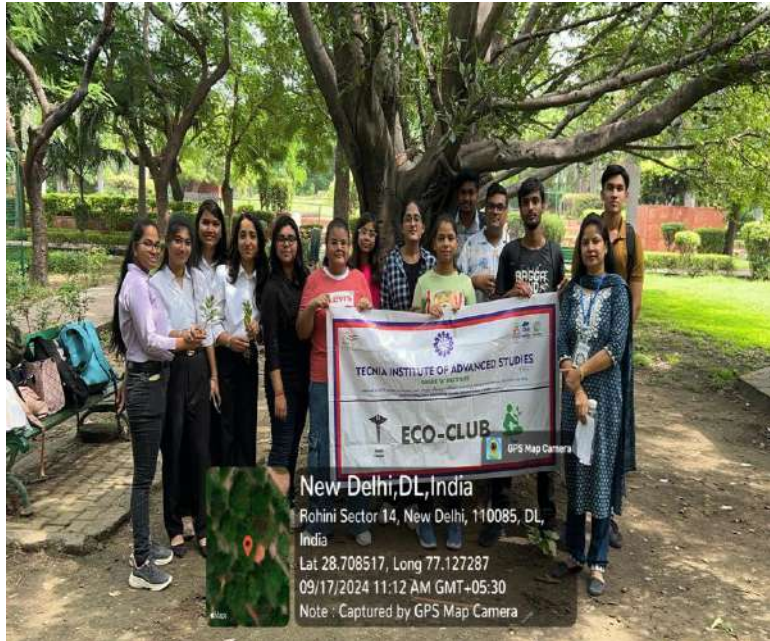
Students Participate in “Tree Plantation Drive”