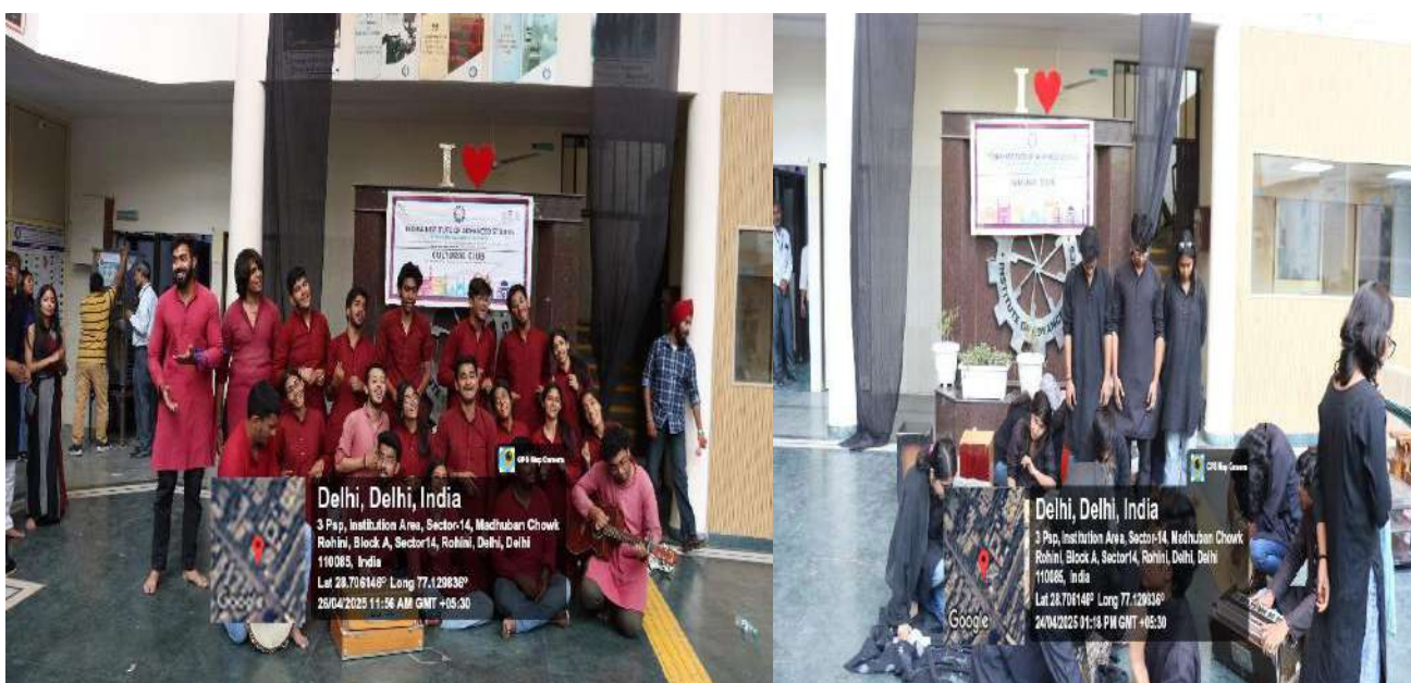
(In the Left) Team Aavran' Who secured 1 st Position and (In the Right) Team Leher' Who secured 2 nd Position.