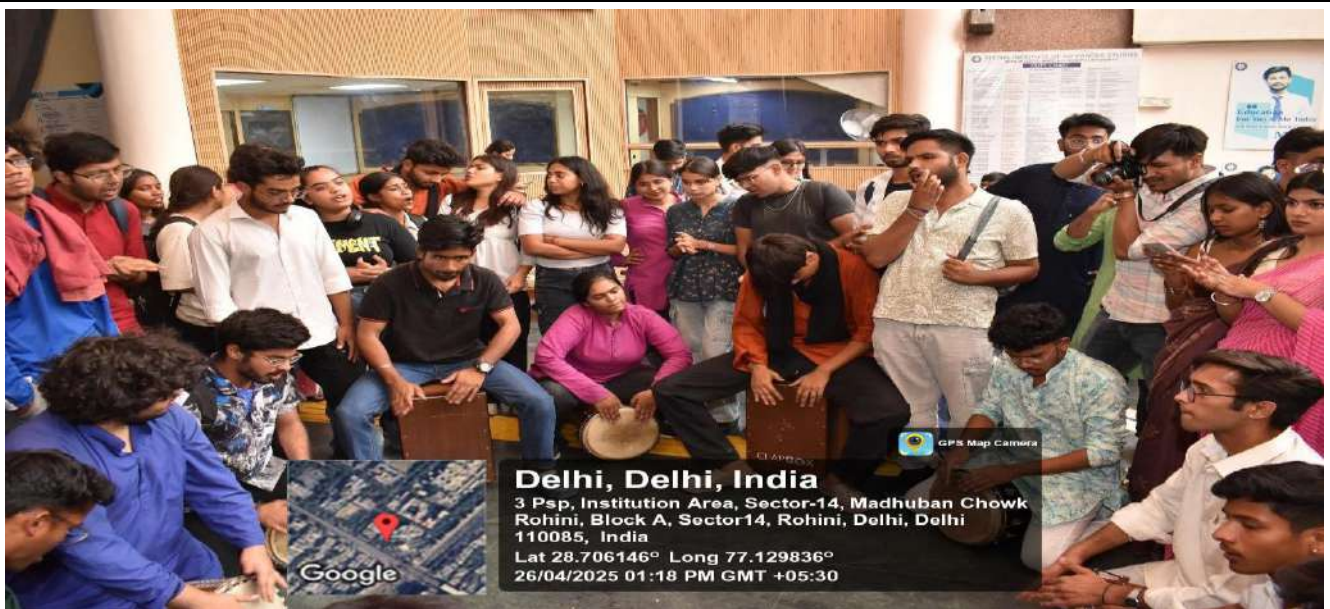
"For the Closing of the Event, Team's Conduct Jamming Session to Glorify the Art Of Street Play."