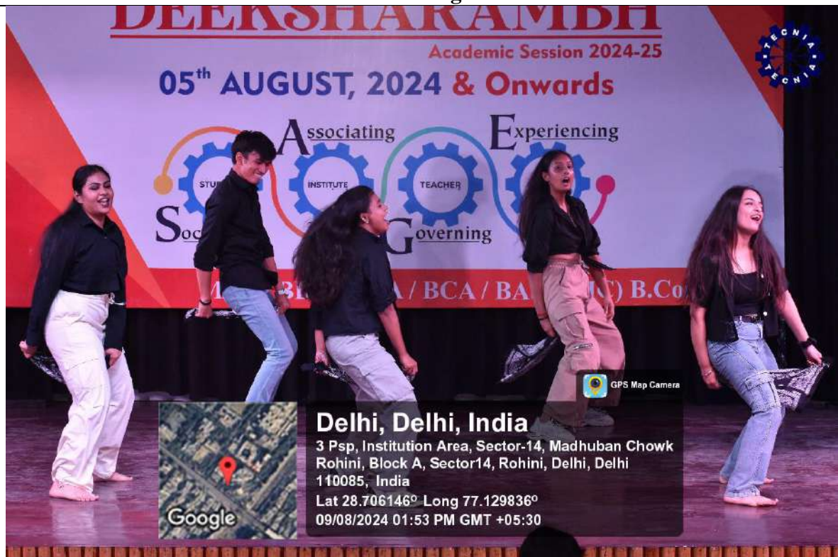
Students showcasing their Talent

Lat 28.706146° Long 77.129836° 09/08/2024 01:12 PM GMT +05:30