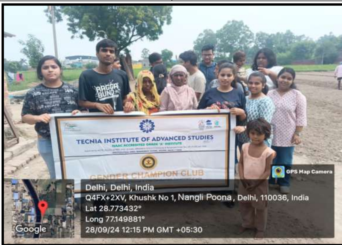
Students with community members making them aware about Domestic Violence