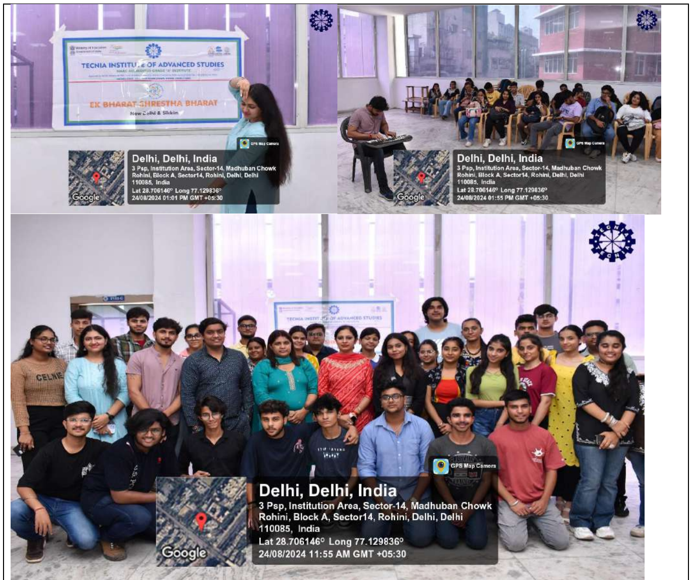
Celebrating the power of music and unity on EBSB Day, where melodies transcend borders and bring us close together through cultural harmony.

Report: Description in (min 250 to max 800 words)*