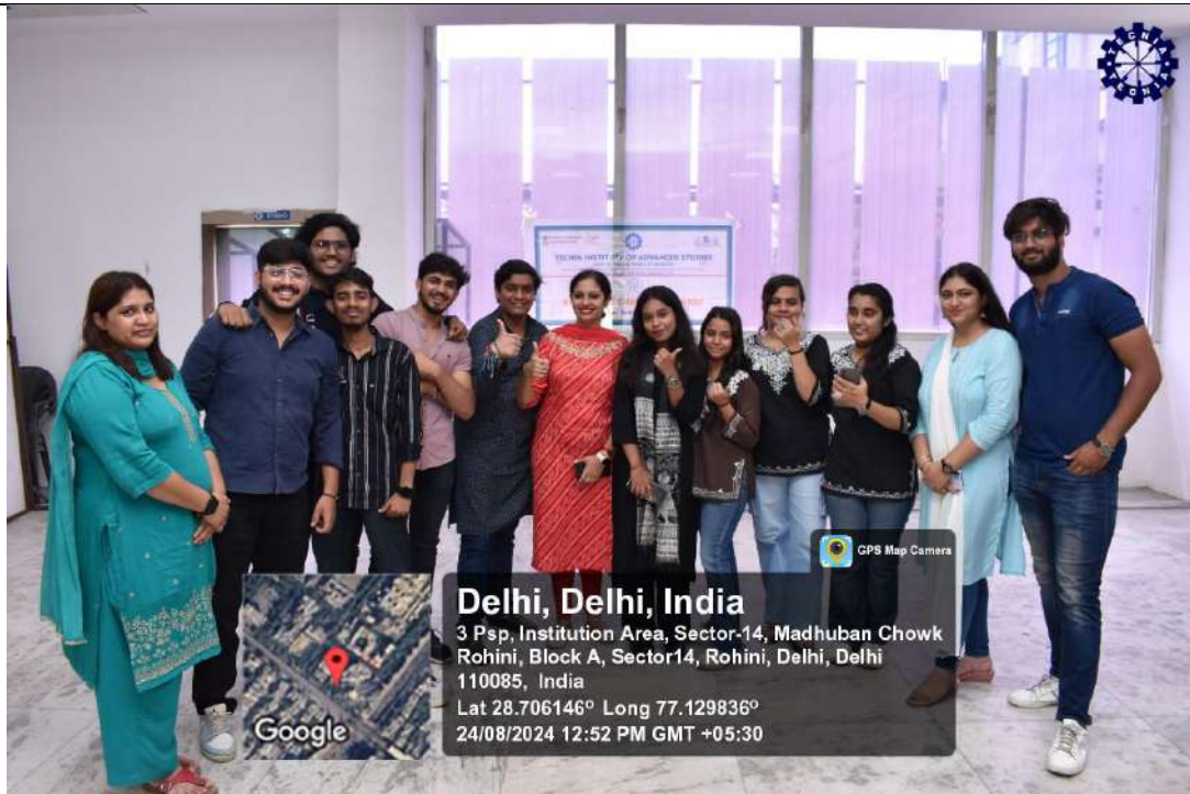
Celebrating Ek Bharat Shreshtha Bharat (EBSB) Day at Tecnia Institute of Advanced Studies with enthusiasm and unity!