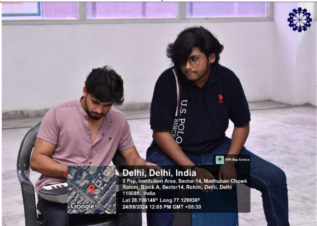
Melodies in motion! Students showcasing their musical talent.