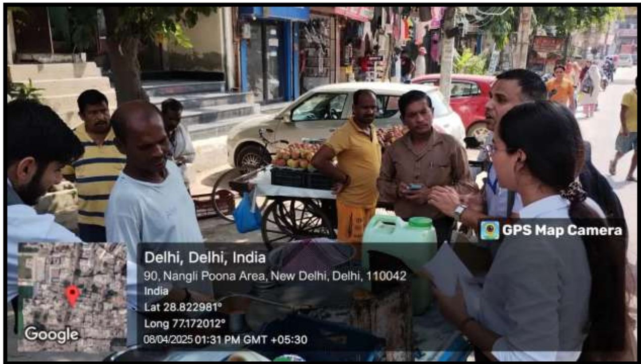
Students with community members creating awareness about Gender neutral Toys