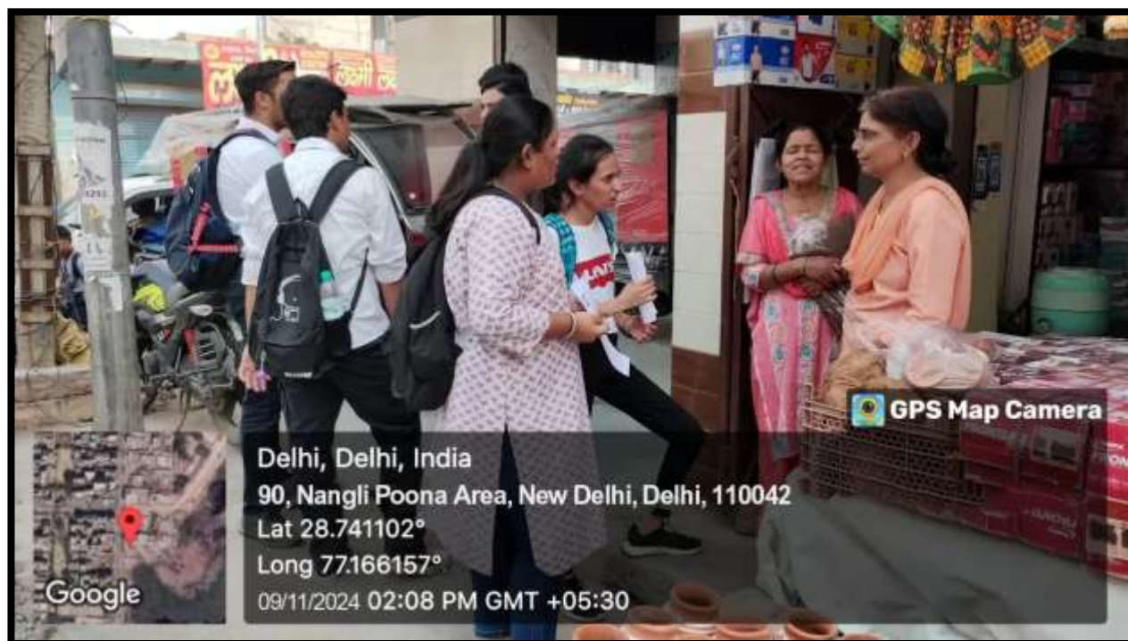
Students with community members creating awareness about Women's Health and Hygiene