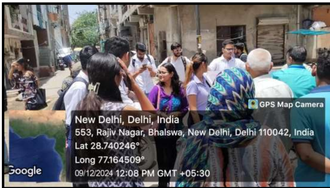
Students with community members creating awareness about Cyber-bullying