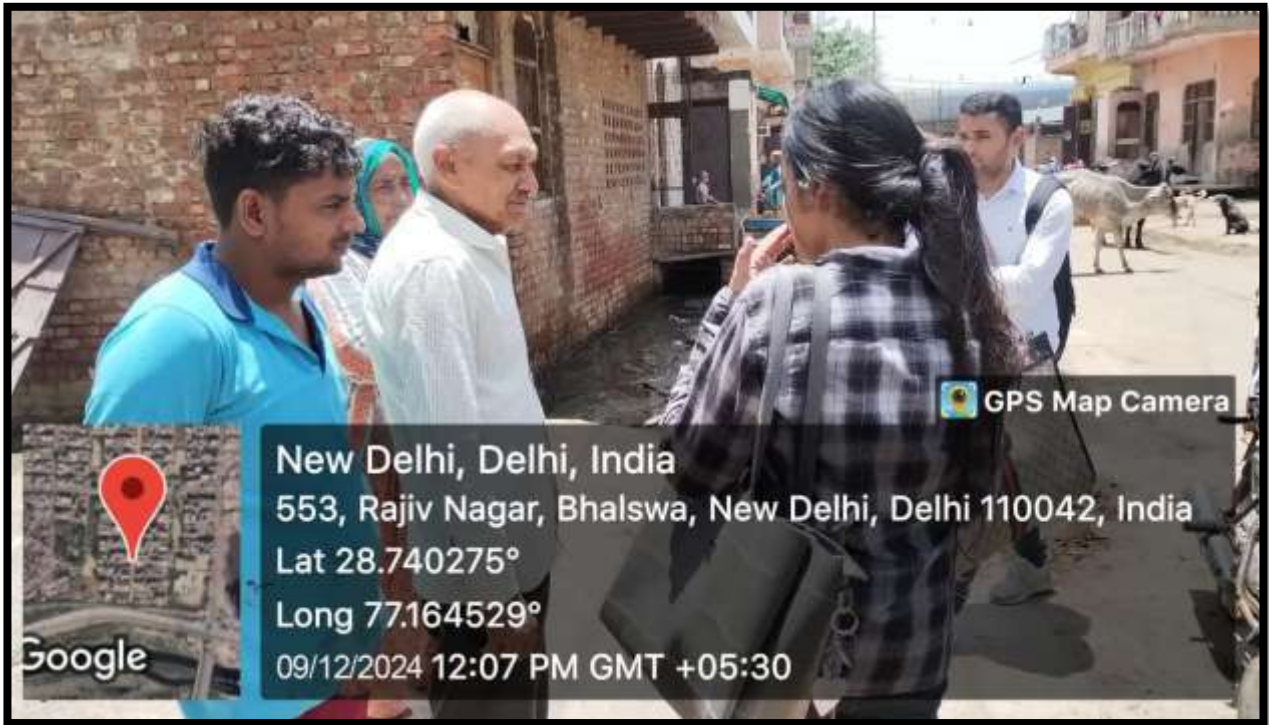
Students with community members creating awareness about Cyber-bullying