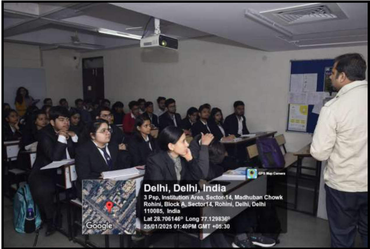
Students participating in the Debate on “Gender Equality in workplace- Is remote work the answer to gender disparities?”