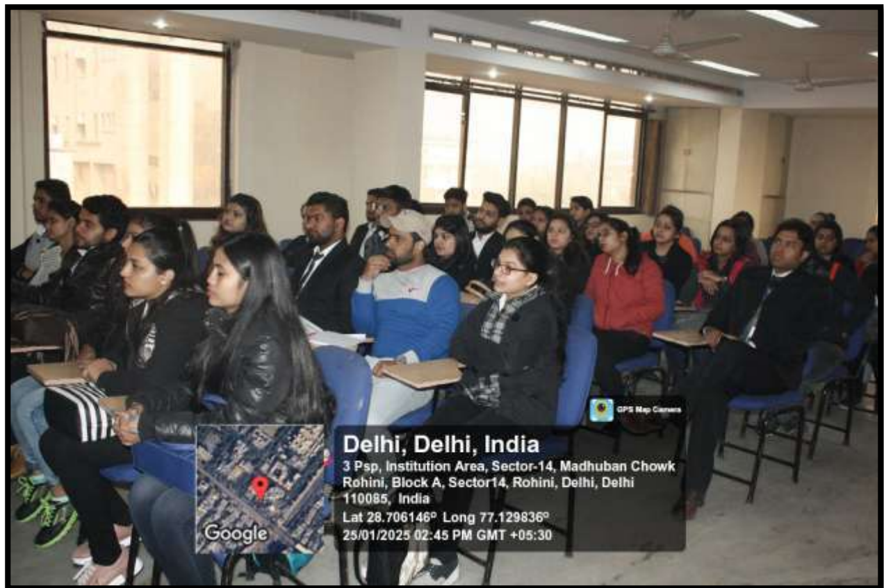
Students participating in the Debate on “Gender Equality in workplace- Is remote work the answer to gender disparities?”