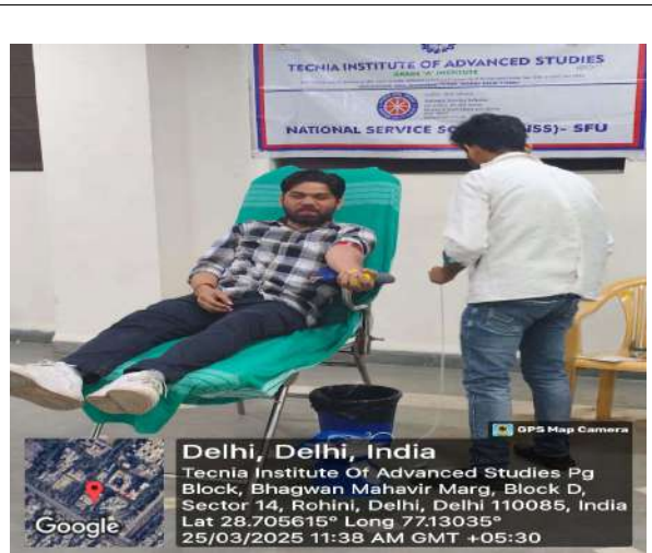
Delhi, Delhi, India Tecnia Institute Of Advanced Studies Pg Block, Bhagwan Mahavir Marg, Block D, Sector 14, Rohini, Delhi, Delhi 110085, India Lat 28.705615° Long 77.13035° 25/03/2025 11:38 AM GMT +05:30