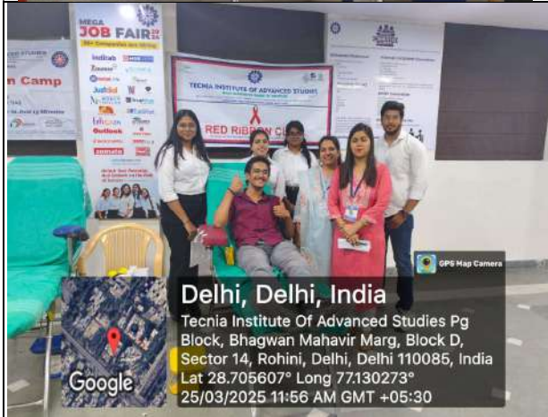
Delhi, Delhi, India Tecnia Institute Of Advanced Studies Pg Block, Bhagwan Mahavir Marg, Block D, Sector 14, Rohini, Delhi, Delhi 110085, India Lat 28.705607° Long 77.130273° 25/03/2025 11:56 AM GMT +05:30