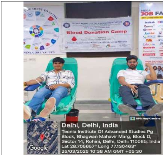
Delhi, Delhi, India Tecnia Institute Of Advanced Studies Pg Block, Bhagwan Mahavir Marg, Block D, Sector 14, Rohini, Delhi, Delhi 110085, India Lat 28.705657° Long 77.130463° 25/03/2025 10:38 AM GMT +05:30