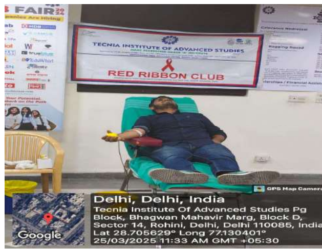
Delhi, Delhi, India Tecnia Institute Of Advanced Studies Pg Block, Bhagwan Mahavir Marg, Block D, Sector 14, Rohini, Delhi, Delhi 110085, India Lat 28.705629° Long 77.130401° 25/03/2025 11:33 AM GMT +05:30