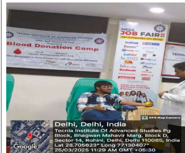
Delhi, Delhi, India Tecnia Institute Of Advanced Studies Pg Block, Bhagwan Mahavir Marg, Block D, Sector 14, Rohini, Delhi, Delhi 110085, India Lat 28.705623° Long 77.130407° 25/03/2025 11:29 AM GMT +05:30