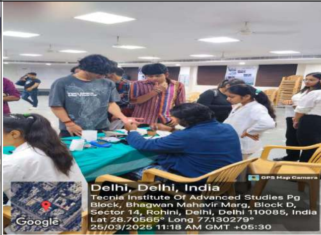
Delhi, Delhi, India Tecnia Institute Of Advanced Studies Pg Block, Bhagwan Mahavir Marg, Block D, Sector 14, Rohini, Delhi, Delhi 110085, India Lat 28.705665° Long 77.130279° 25/03/2025 11:18 AM GMT +05:30