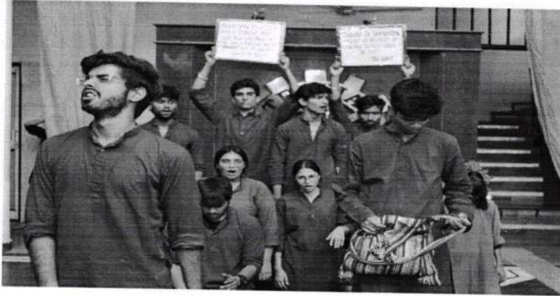
Photograph of the Event

n Internal Circle, Tecnia Institute of Advanced Studies New Delhi-110085