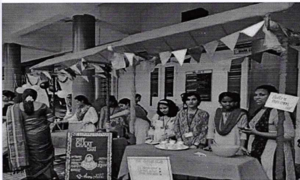
Students during the Food Festival