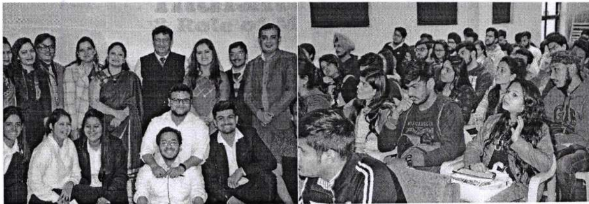
Students enhancing their skills on Storytelling