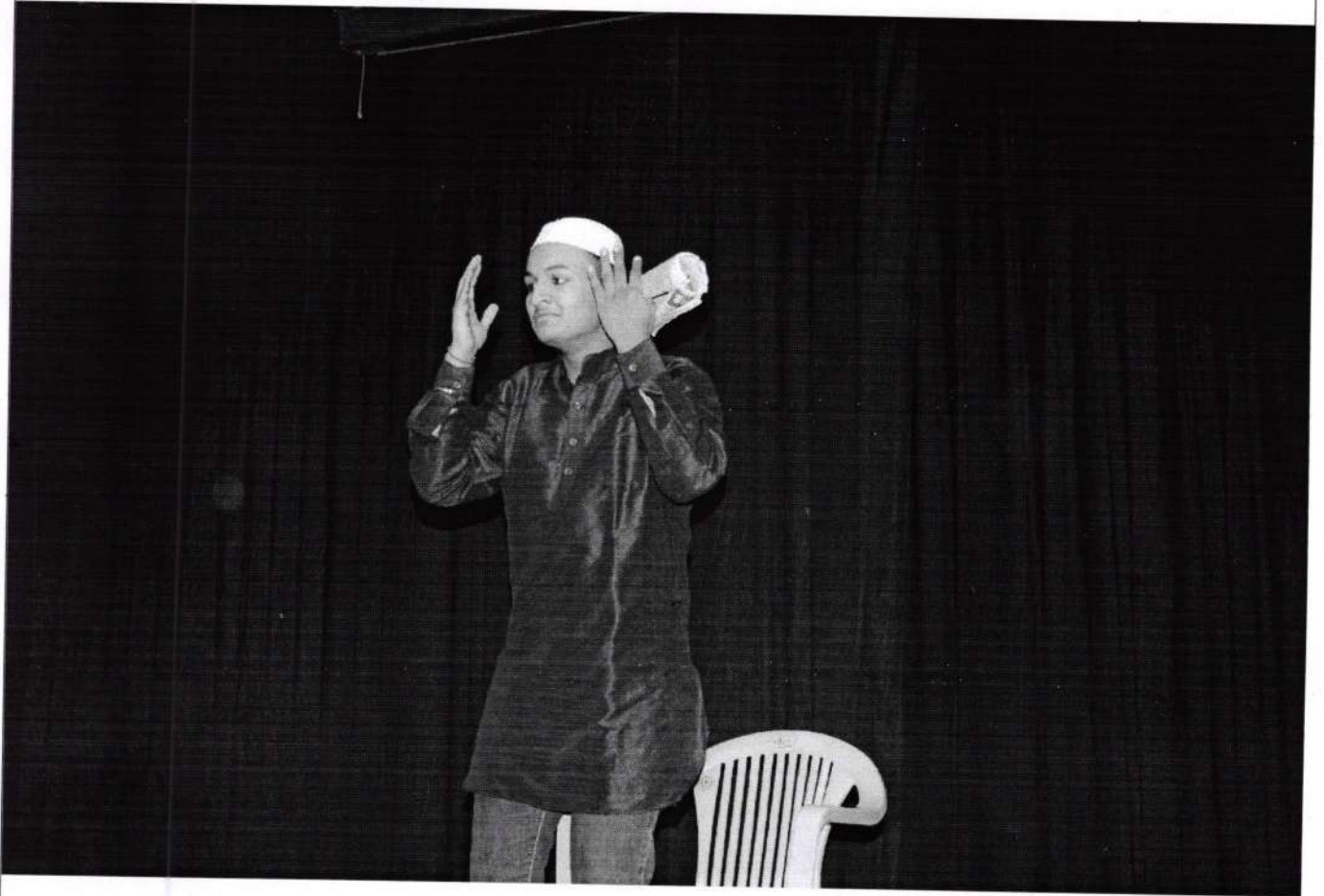
Student performed Stage play