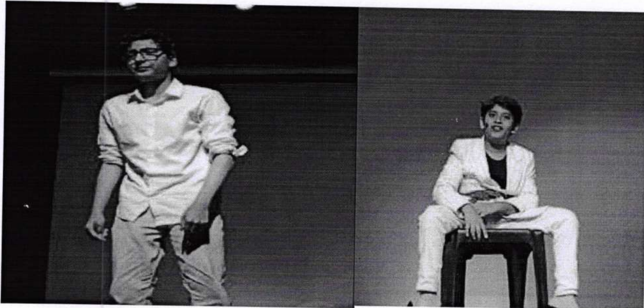
Students performing mono - acts